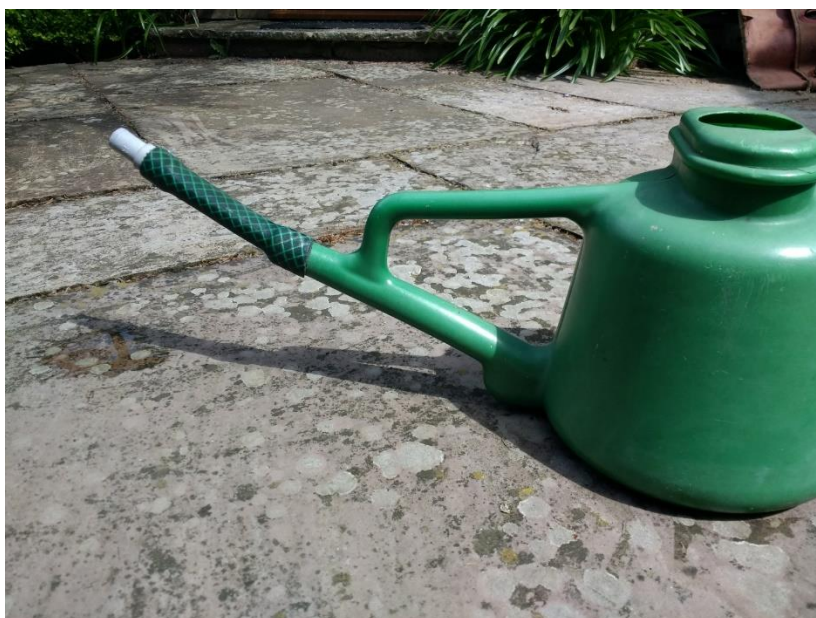
Hose extension to watering can