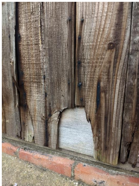
Mending a fence panel