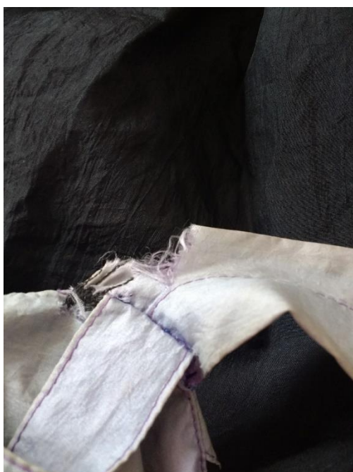
Sewing repair needed