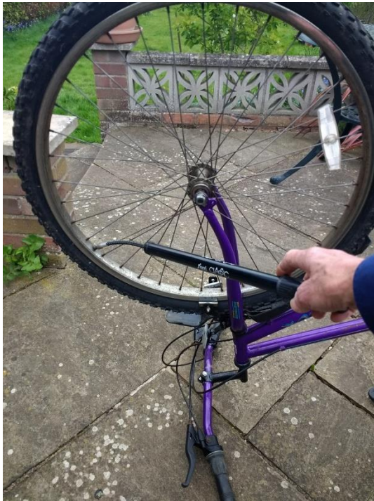
Fixing a flat bike tyre