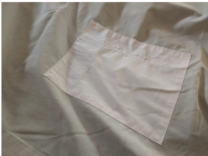
Fixing a patch on a bed sheet