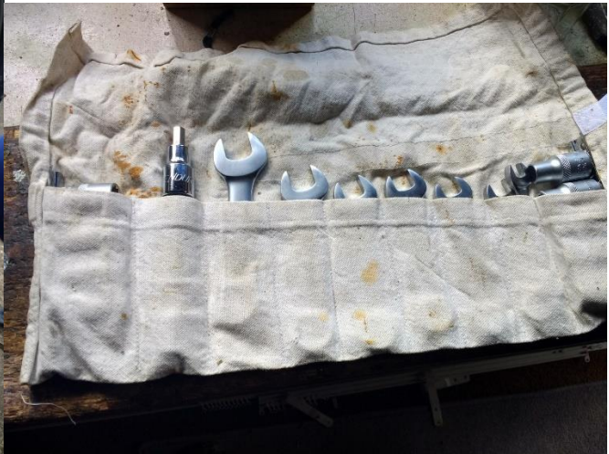
Tool roll, similar to a lady's maid