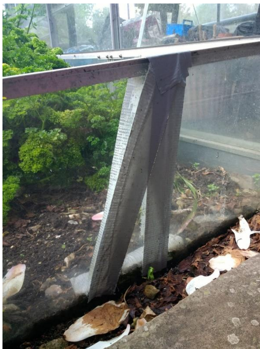
Mending a glass pane ( Careful of broken glass, it can be sharp )