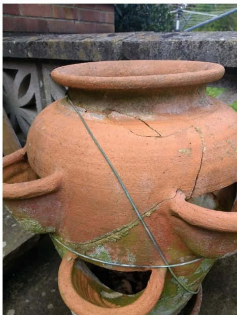
Mending a strawberry pot