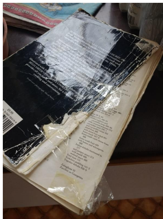
Book in serious need of repair