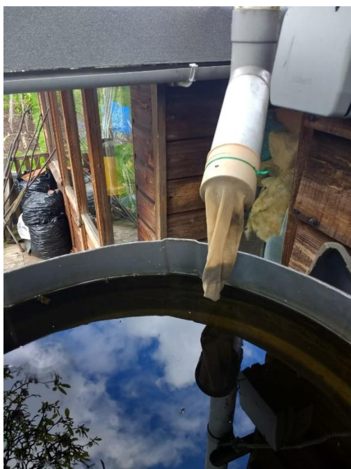
Filtration for water tank using the end of tights